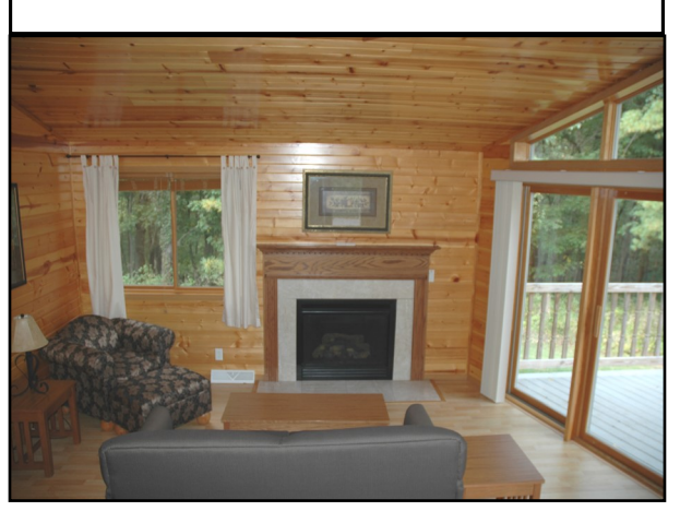
Revised January 2019