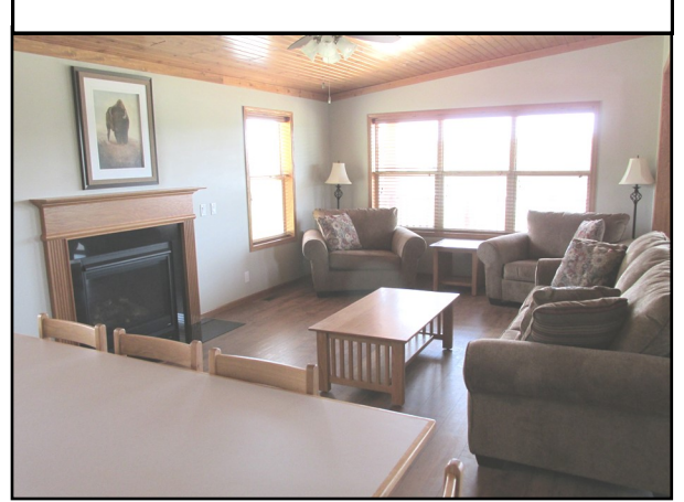
Revised Jan 2019