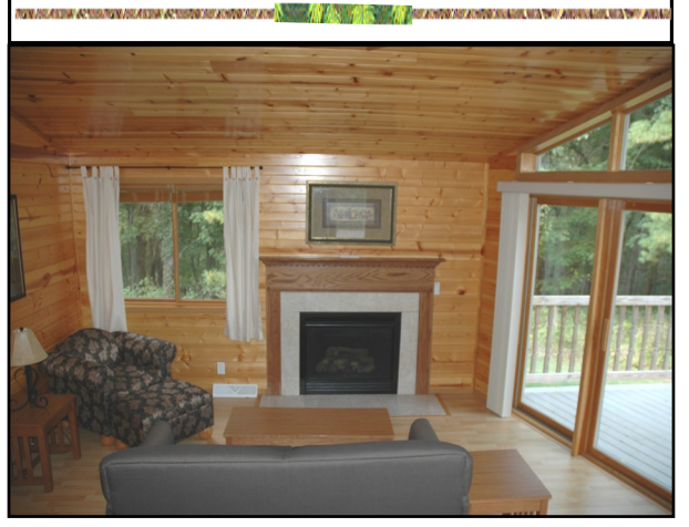
Revised January 2021