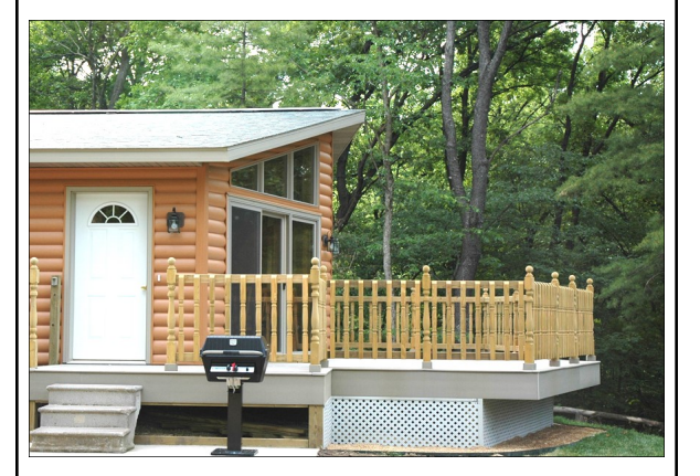
Map of Scott County Park