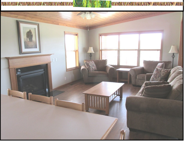
Revised Jan 2021