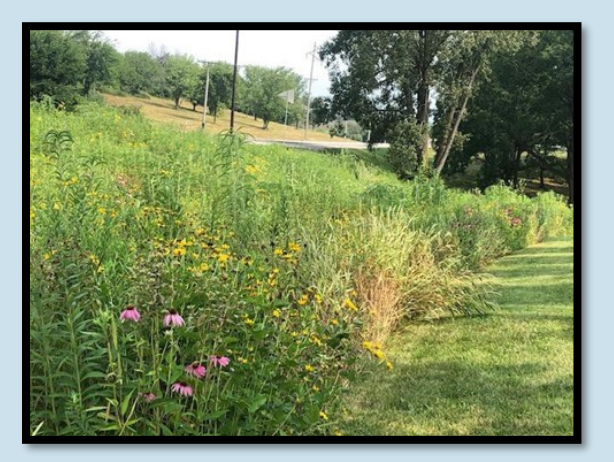
We're controlling erosion. We're making habitat for birds. We're making the world a better place. - Brian Burkholder -

Native plants add color and natural beauty to the right-ofway. These tallgrass prairie roadside plantings restore a piece of Iowa's natural heritage.