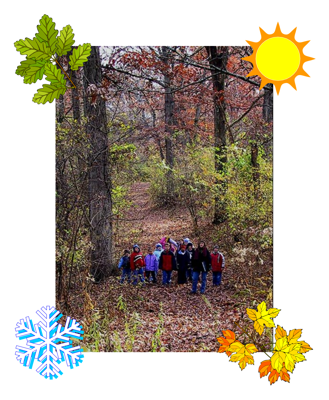
Field Trip Planner

For schools, youth groups and other organizations