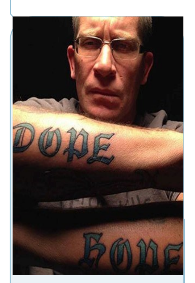
From Dope to Hope