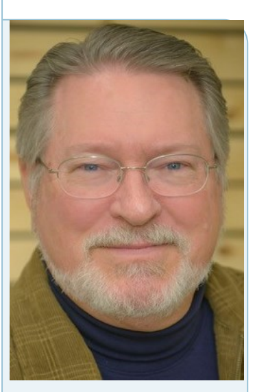
Mass Fatality Incident Management/Lessons Learned

FEMORS Deployments: Hurricane Ivan: Pensacola, FL. Interstate I-75 Crash, Gainesville, FL.